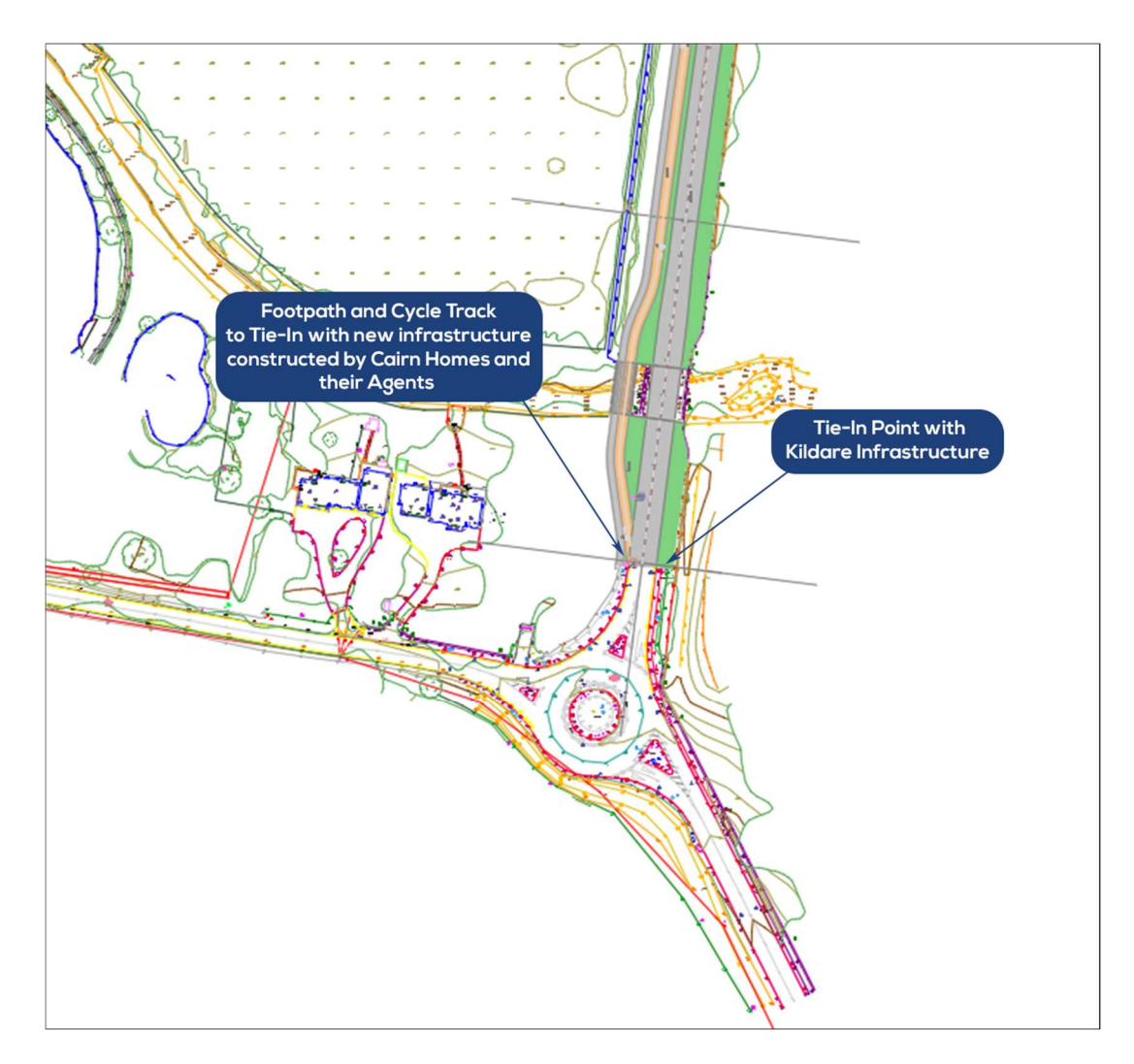
Figure 2: MOOR Eastern Kildare Tie-In

The MOOR will be a single carriageway road connecting the Maynooth environs between the east and west. On the eastern side, the road will tie in in Kildare County, just north of the roundabout on the R157. A separate cycle and pedestrian bridge will be constructed alongside the existing bridge to allow for continuation of this infrastructure, tying in with existing infrastructure in Kildare County. This can be seen in the figure below.